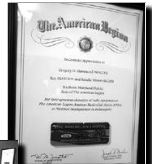
Above: A plaque on the wall of the "Radio Shack" thanks members of the S.A.L.