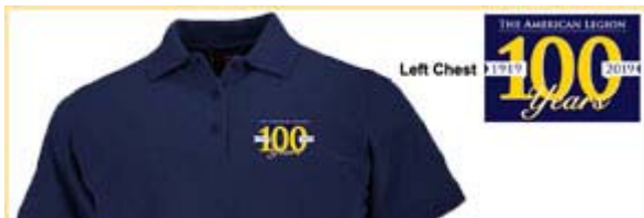
Centennial Polo - $38.95