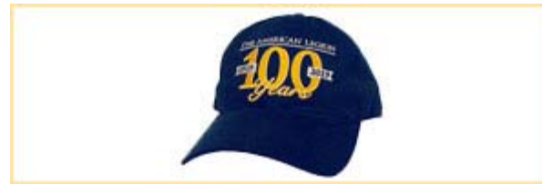
Centennial Cap - $17.95