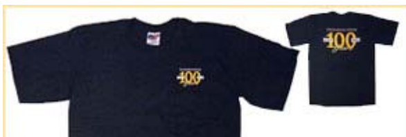
Centennial T-shirt - $16.95