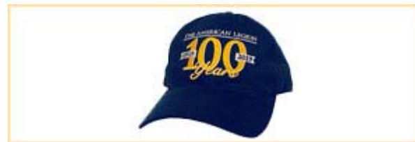
Centennial Cap - $17.95