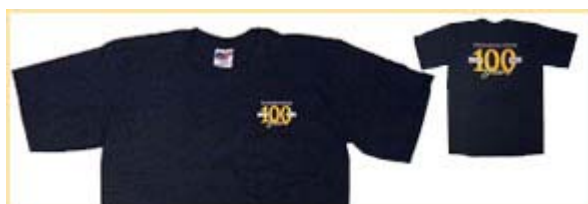
Centennial T-shirt - $16.95