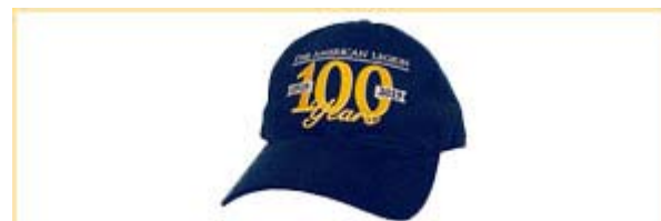
Centennial Cap - $17.95