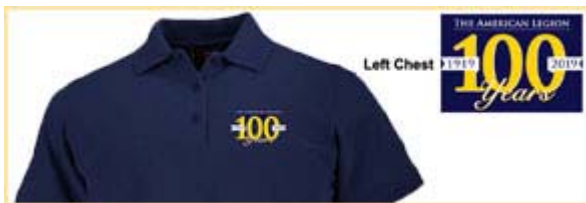
Centennial Polo - $38.95