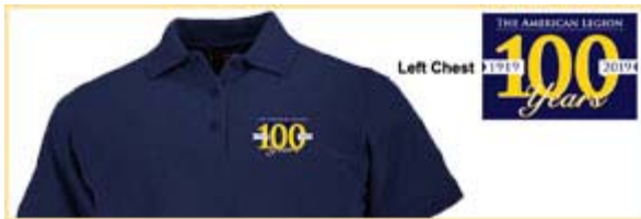
Centennial Polo - $38.95