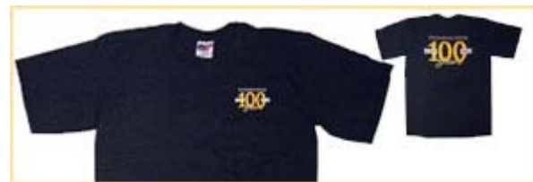
Centennial Pocket T-shirt - $16.95