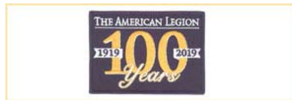
Centennial Patch - $3.95

JOIN THE AMERICAN LEGION VETERANS SERVING VETERANS