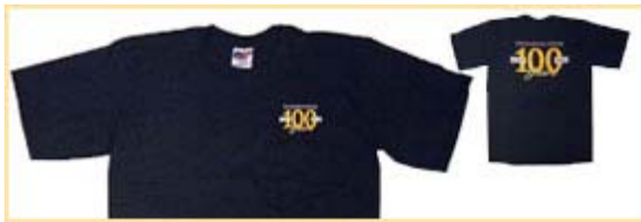
Centennial T-shirt - $16.95