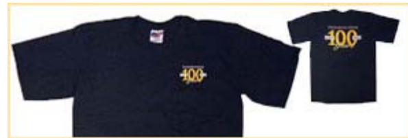
Centennial Pocket T-shirt - $16.95