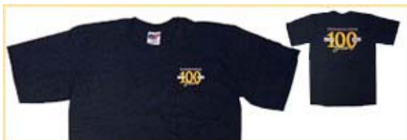
Centennial T-shirt - $16.95