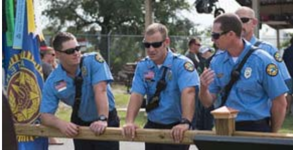
Making sure no one forgets 9/11