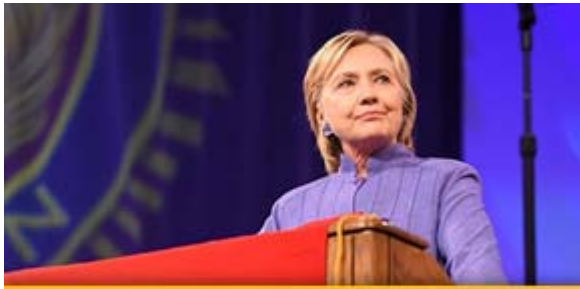
Clinton addresses Legion convention