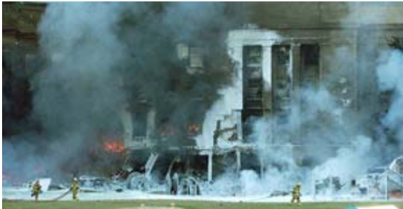
The 9/11 national commander