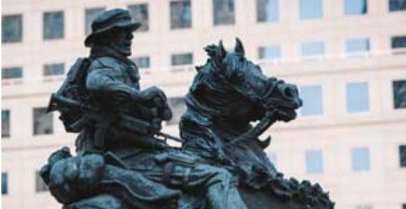
9/11 monument forever links first responders, Special Forces