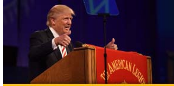
Trump addresses Legion's national convention