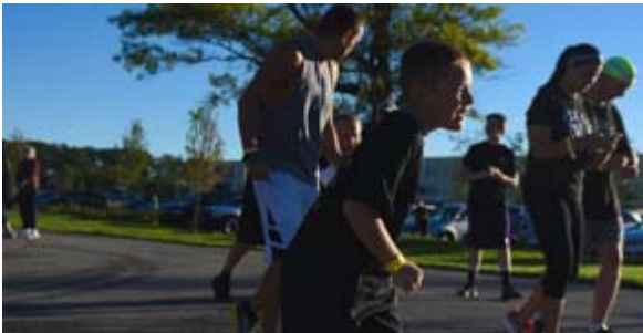
A Legion Day of honor, remembrance and patriotism