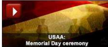
USAA: Memorial Day ceremony