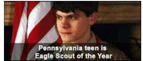
Pennsylvania teen is Eagle Scout of the Year