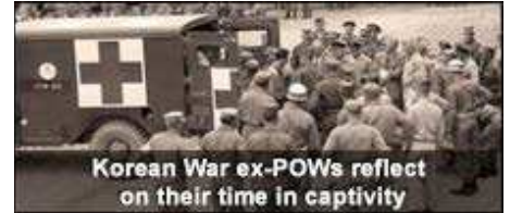
Korean War ex-POWs reflect on their time in captivity