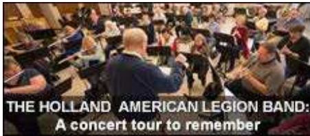
THE HOLLAND AMERICAN LEGION BAND: A concert tour to remember