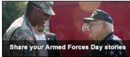
Share your Armed Forces Day stories